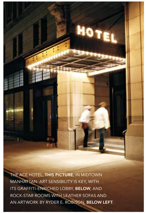
THE ACE HOTEL, THIS PICTURE, IN MIDTOWN MANHATTAN. ART SENSIBILITY IS KEY, WITH ITS GRAFFITI-ENRICHED LOBBY, BELOW , AND ROCK-STAR ROOMS WITH LEATHER SOFAS AND AN ARTWORK BY RYDER E. ROBISON, BELOW LEFT .

BOOK IT: Visit Ace Hotel at acehotel.com/newyork .