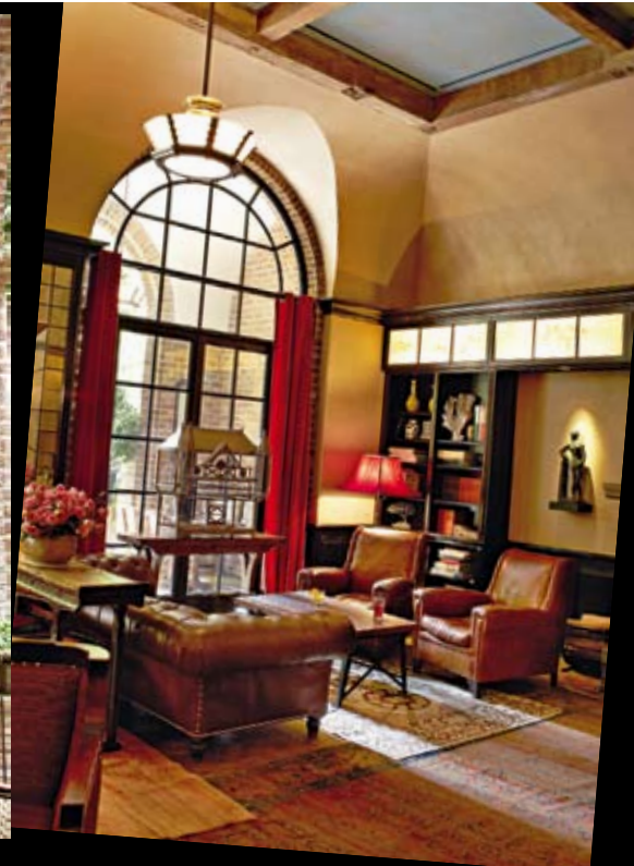
A COUNTRY-STYLE BREAKFAST, ABOVE LEFT , AT THE GREENWICH HOTEL; WAIT STAFF AT THE GREENWICH ARE EVER ON HAND AT THE GRAND ENTRANCE TO THE COURTYARD; BREAKFAST CAN ALSO BE TAKEN IN THE SUMPTUOUS DRAWING ROOM, RIGHT . IN THE WARMER MONTHS, THE LUSH COURTYARD, OPPOSITE , IS A FAVOURED ESCAPE FOR GUESTS.